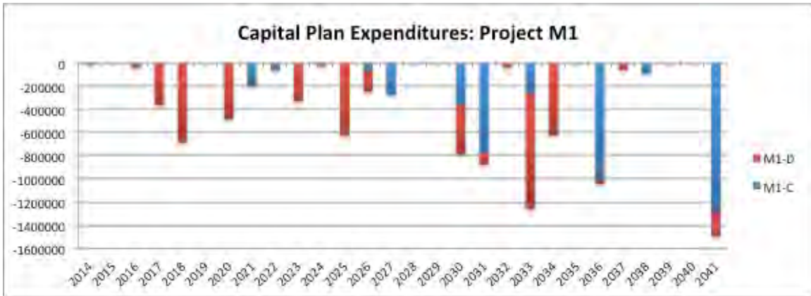
Figure 2: Projected annual capital requirements from BCA

Each property consists of family row townhomes and all have been well maintained and are in good condition. Normal replacement is anticipated, although one of the projects has some envelope issues. As shown in Figure 2, which reflects planned expenditures on two of the four projects, there are no major replacements in the immediate future, and those required can be readily accommodated within current reserves and annual contributions.