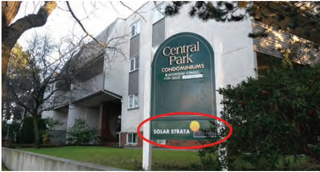
Front sign markets PV system at Central Park in Victoria

endure the test of time. This means that although some of your components may be under warranty, the company might no longer be around to service them.