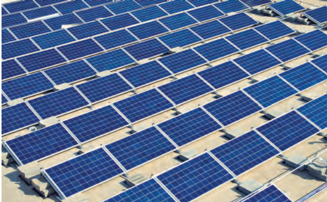
Ballasted PV system installed on flat roof

To help demonstrate the guiding principles outlined in this guide, details from a Case Study are presented as an example.