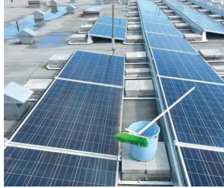
Broom and bucket used to clean the PV modules

The only work required for the PV system at Central Park is washing the PV modules once a year at the same time as the roof skylights are cleaned. In the first year, one of the owners cleaned the system with water and a bit of dish soap, along with a small, nylon floor broom to scrub and rinse the bottom edges (figure above). It took just over half an hour to clean the entire system.