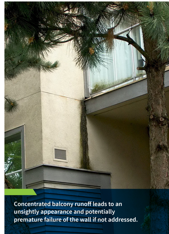
Concentrated balcony runoff leads to an unsightly appearance and potentially premature failure of the wall if not addressed.

All strata corporations of five units or more in British Columbia must complete a depreciation report as required by the Strata Property Act, unless they have passed a three-quarters vote each year they wish to be exempt from the requirements.