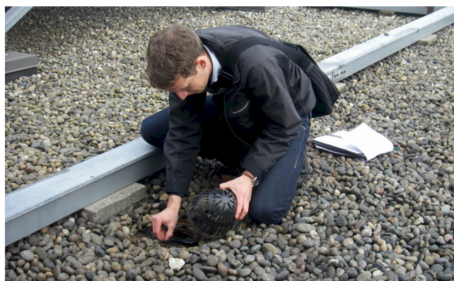
Roof drain cleaning