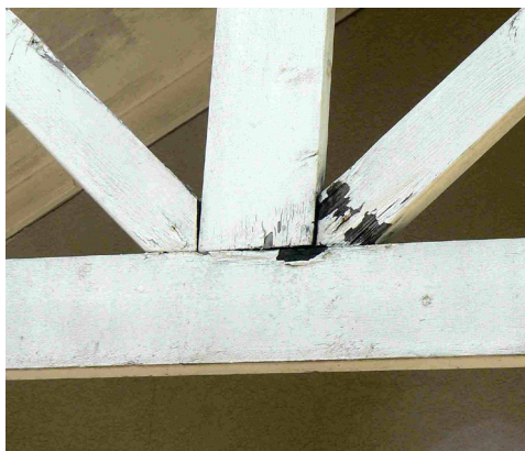
Open joints collect water and lead to deteriorated beams and columns at the connection.

Carpenter ants are black in colour and distinctive for their large size, 6 to 10 mm long. They excavate into wet wood for shelter rather than food. Subterranean termites are also found in some areas of B.C. They are somewhat ant-like in appearance; those found inside wood are white in colour while those observed outside wood are orange or brown. They will consume moist wood.