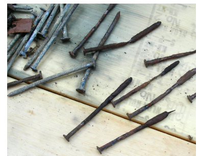
Corroded nails removed from deck boards