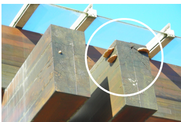
Extended canopy beam with fungi

The following checklists provide a few basic reminders of good inspection and maintenance practices applicable to most exposed wood structures. Of course, the best inspections are those done by knowledgeable contractors and building professionals who may notice things that the average homeowner may miss.