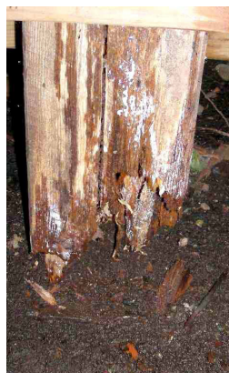
Deteriorated post in direct contact with soil.