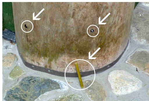
Installation of boron rods at base of post will provide greater resistance to decay. Boron rod shown leaning against base of post and locations where installed are highlighted by white arrows.