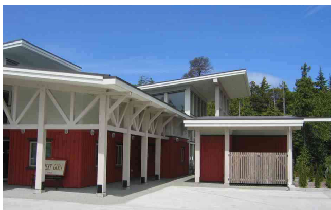
Roof or canopy structures minimize wetting of wood posts and beams.

Exterior wood elements come in contact with moisture through exposure to rain or ground water. A third possible