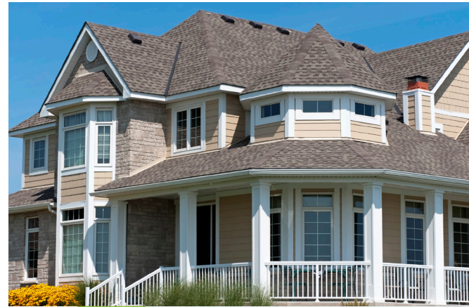
Exposed wood posts, trim, balcony guards and decks require regular maintenance to retain their appearance and function.

Buildings represent a significant financial investment for society as a whole and for individual homeowners. The costs associated with buildings can be broken down into a number of categories. The costs of initial construction, review and maintenance, repair, and eventually the costs of renewal or replacement of components are all part of the building life cycle costs. Costs incurred after the initial construction of the building are significantly affected by decisions made at the time of the original construction. While most owners have no control over these early decisions, they can minimize future repair and replacement costs through effective building management.