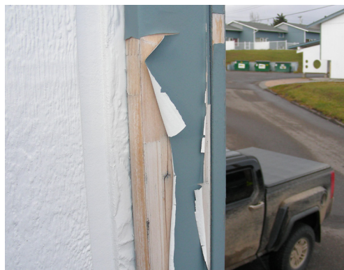
Paint peeling from wood substrate